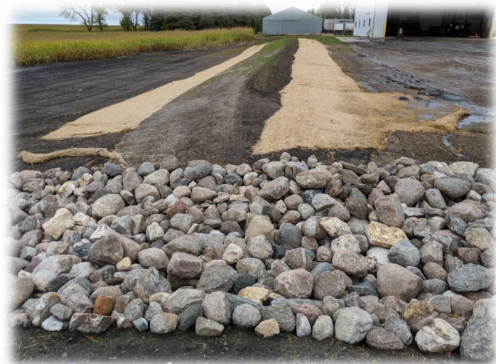
EMBANKMENT NORTH OF CHANNEL, WITH VEGETATION BEGINNING TO GROW.