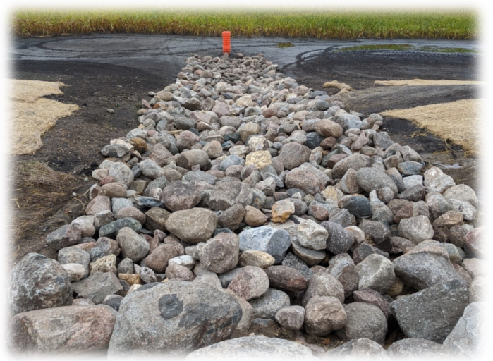
COMPLETED ROCK LINED CHANNEL.

OUR MISSION: THE SWIFT COUNTY SOIL AND WATER CONSERVATION DISTRICT IS COMMITTED TO PROVIDING HIGH QUALITY TECHNICAL, FINANCIAL, AND EDUCATIONAL ASSISTANCE TO LANDOWNERS AND LAND MANAGERS OF SWIFT COUNTY BY PROMOTING SOUND STEWARDSHIP OF OUR LAND AND WATER RESOURCES.