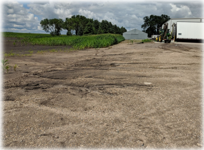
RILL EROSION WASHING FROM YARD TOWARDS TILE INTAKE.