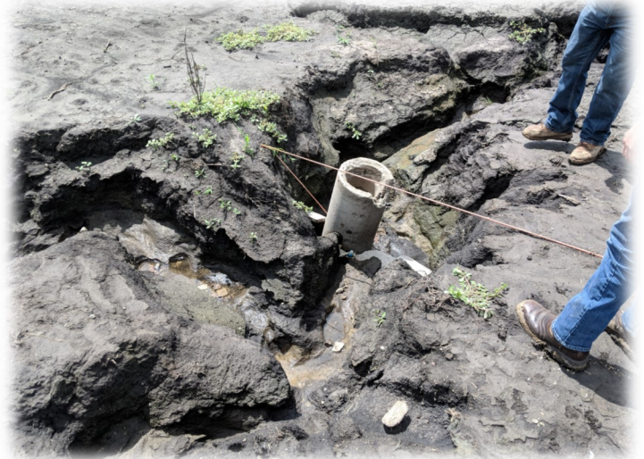
COUNTY TILE INTAKE THAT FAILED AND CAUSED GULLY EROSION.